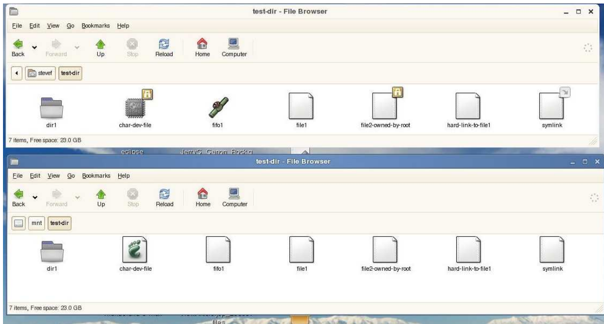
Figure 1: Without extensions to CIFS, local (upper window) vs. remote (below) transparency problems are easily visible

optimize. The improved atomicity of mkdir and create makes error handling easier (e.g. in case a server failed after a create operation, but before the SetPathInfo ).