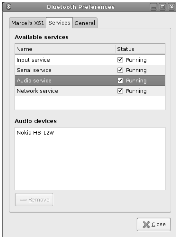
Figure 5: GNOME integration

easy access. The current integration into the Bluetooth GNOME application has just started. Figure 5 shows the initial integration.